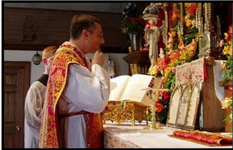
The Priest concludes the prayer and breaks the Host.