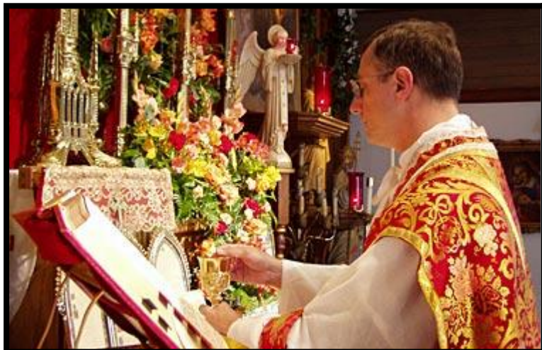
The Priest makes the sign of the Cross with the Sacred Host over the Chalice, saying the Pax vobiscum , The peace of the Lord be always with you, and the server replies And with thy spirit.

V. The ✠ Peace of the ✠ Lord be with you ✠ always. R. And with your spirit.