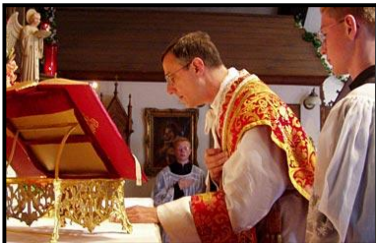
Bowing down, the Priest strikes his breast three times as a sign of contrition and humility, saying the threefold Lamb of God , who takes away the sins of the world, have mercy upon us, grant us your peace.

V. The ✠ Peace of the ✠ Lord be with you ✠ always. R. And with your spirit.